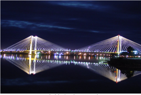
Cable Bridge at night.

We set up a long weekend to see friends and explore any opportunities God might open, with plans to return to Puyallup on Monday. Shortly before our departure for the trip we found out that our return plans had fallen through and we had nowhere to come back to after the weekend. We knew God had spoken to go over so we packed up everything we had with us in the van and trailer and my car, and off we went to explore this new direction.